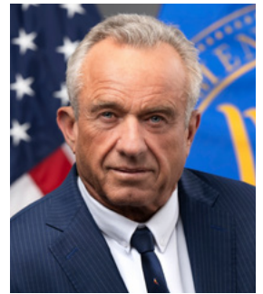
A picture of Robert F. Kennedy Junior.

Robert Kennedy is a rule maker. His job is to make rules that keep 👥 people 🏥 healthy . He made some changes to the old rules.